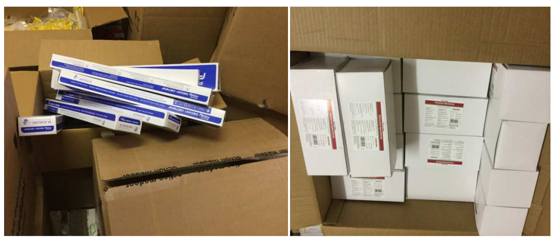
Nasogatric tubes and catheters