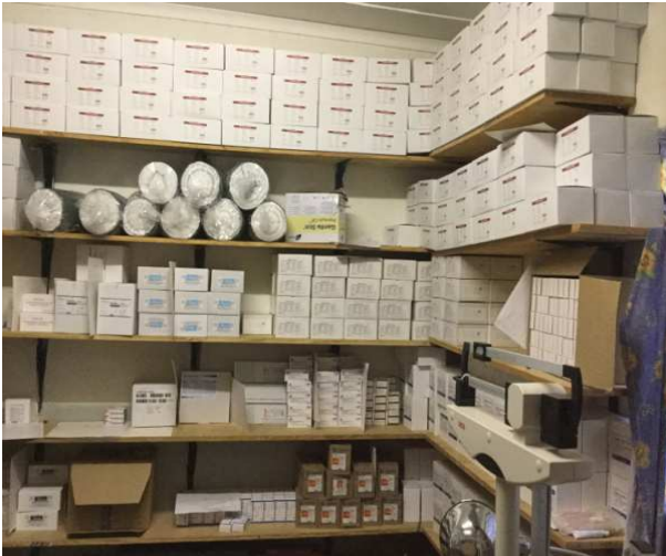
sundries on the shelves