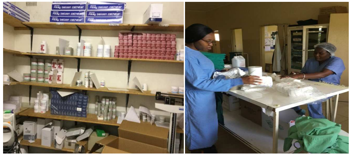
Various medicines arranged on the shelves Making operation packs in Theatre.