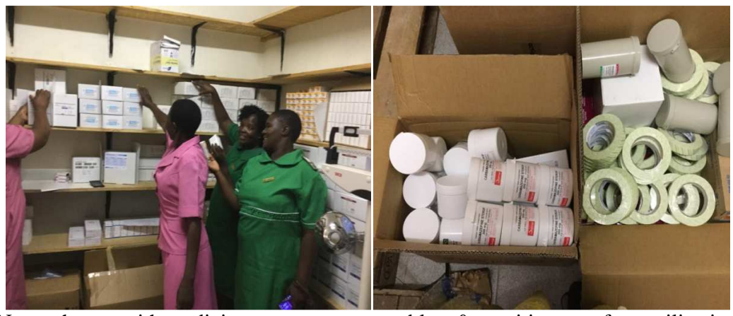
Nurses happy with medicines