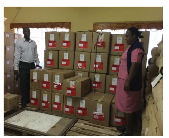
Boxes with antibiotics and sundries